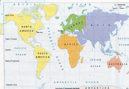
Political map of the world.