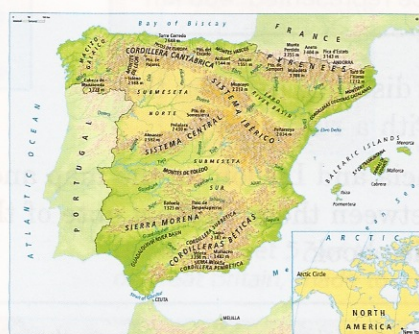
Topographic maps of Spain.